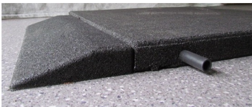
View of transition and tile with dowel