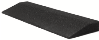
Transition piece to avoid trip hazard 19 1/2" Long and 6" wide.